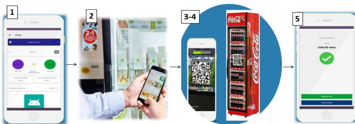
Figure 3 - Stages of implementation