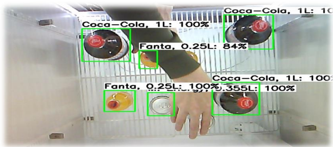
Figure 1 - The motion sensor recognition using RFID tag technology

There are many types of RFID tags. The choice depends largely on the limitations of the application. Typically, tags are grouped according to common criteria related to energy, read range and capabilities, memory access.